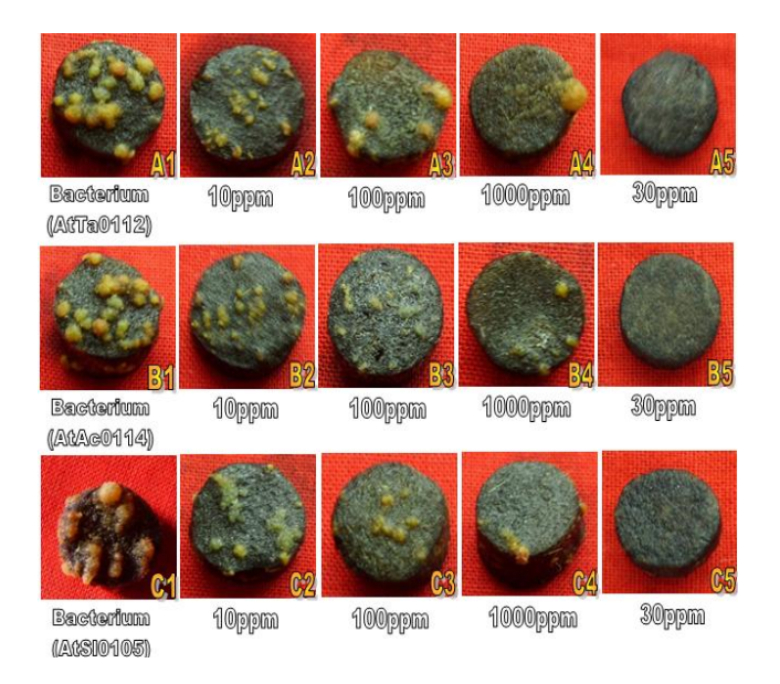
Fig. 2: Photographs showing gradual tumor inhibition by the methanol leaf extract of C. roseus on potato discs. A<sub>1</sub>, B<sub>1</sub> and C<sub>1</sub> as negative control; A<sub>2</sub>, B<sub>2</sub> and C<sub>2</sub> as 10ppm plant extract; A<sub>3</sub>, B<sub>3</sub> and C<sub>3</sub> as 100ppm plant extract; A<sub>4</sub>, B<sub>4</sub> and C<sub>4</sub> as 1000ppm plant extract; A<sub>5</sub>, B<sub>5</sub> and C<sub>5</sub> as 30ppm camptothecin (positive control).